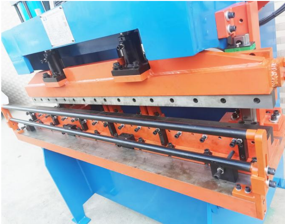
2. The double head is fixed, the large sliding rails on both sides slide, the heavy oil cylinder is adjustable, the whole machine is stable and powerful, and the cutting angle is controllable.