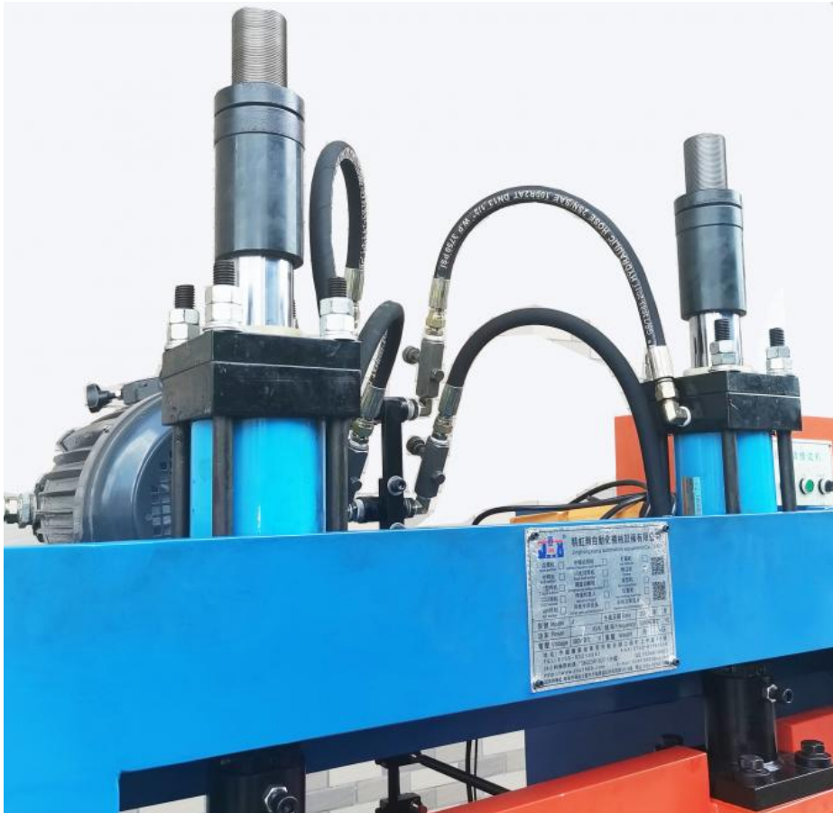
3. Large motor + high-pressure pump + large flow valve provide large power for the whole machine, and the hydraulic cooling pump provides large power for long-term operation without being affected by high temperature.